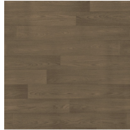
Monte Carlo L61