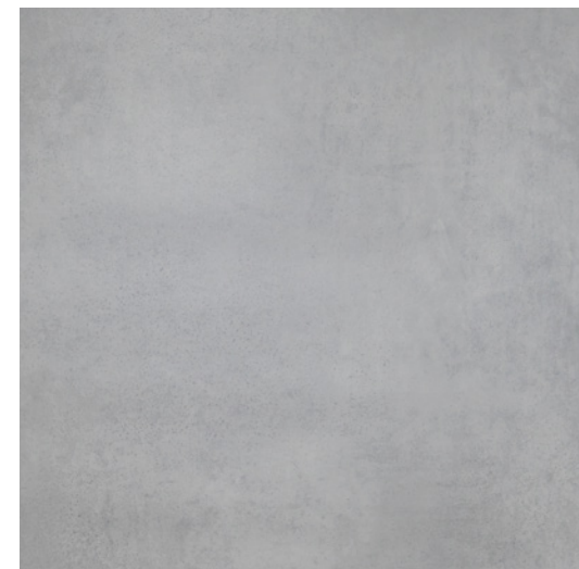
London Stone T98