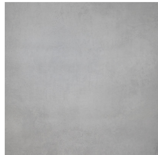
London Stone T91